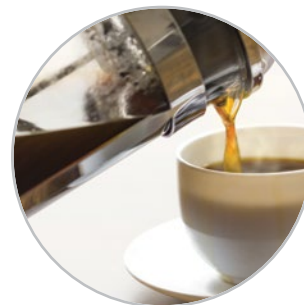
French Press Coffee

At Dash, we believe that happiness is homemade, so get ready to get cooking. Here are some ideas for foods and beverages that you can make with your Dash Rapid Kettle.