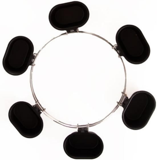
Serving Ring & Fondue cups