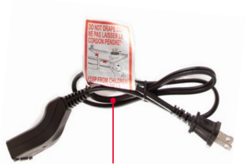
Magnetic Power Cord