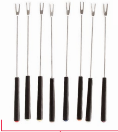
8 x Forks