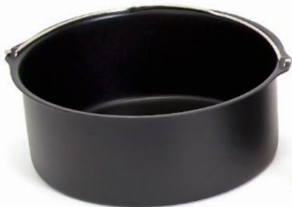
Deep Dish Baking Pan