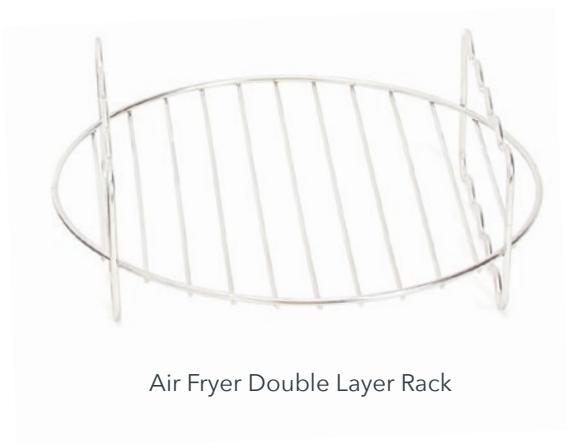
Air Fryer Double Layer Rack