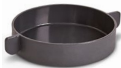
Large Silicone Cup