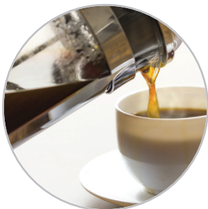
French Press Coffee