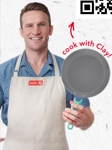
↑ cook with Clay!