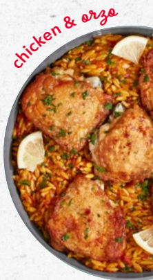
chicken & orzo