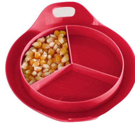
Measuring Cup Each part of the Measuring Cup holds \frac{1}{3} cup of kernels.